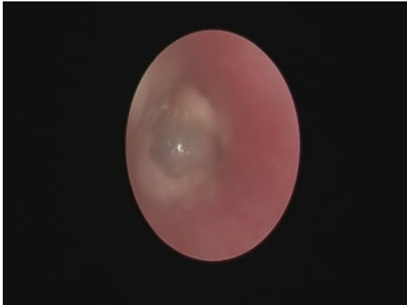
Fig. 3. Fleshy glistening-textured foreign body seen in the left main bronchus

asymptomatic immediately after the incident of choking, with no signs of respiratory distress. Parents will only seek medical treatment when their child develops complications, such as pneumonia, bronchitis or lung collapse. Misdiagnosis may occur in the first phase of acute dyspnoea during aspiration as it can be unnoticed. In such cases, aspiration may be treated as a lung disease. The most common symptoms and signs of FB inhalation are cough, wheezing, and reduced breath sounds, which can be overlooked, especially when the patient already has bronchial asthma.