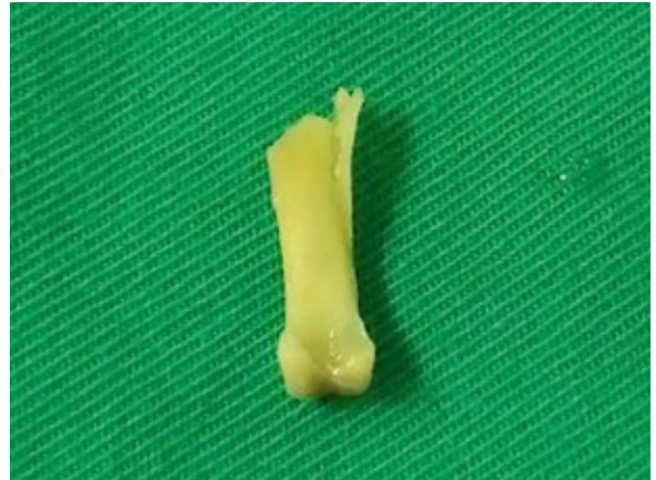
Fig. 4. A removed piece of chicken bone

Foreign bodies may be classified as organic and inorganic. Organic types include nuts, seeds, foods and vegetables while inorganic include needles, plastic elements, toys, crayons and dentures. Nuts are the most commonly reported inhaled FBs (7-9) . There are differences in long-term complications between aspirated organic and inorganic materials (10) . No persistent symptoms (such as cough or wheezing) or bronchiectasis are reported following inorganic FB aspiration, whereas organic materials increase the risk of persistent symptoms and bronchiectasis (10) . Organic FBs are known to initiate inflammation of the adjacent tissue in the airways. Some cases of inorganic FB inhalation are asymptomatic when the FB does not obstruct the airway. Poukkula et al. reported 2 cases of a denture