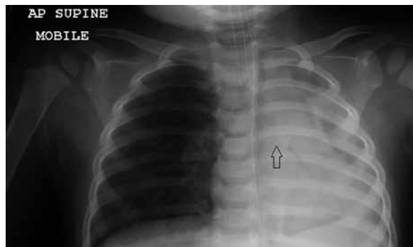
Fig. 2. A repeated chest radiograph shows that the foreign body migrated into the left main bronchus and left lung collapse

Parental negligence occurs when the child appears asymptomatic after FB aspiration or if the choking episode is not witnessed. In our case, the child appeared