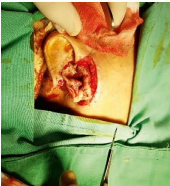
Fig. 2. Wide local excision with local flap performed

SCC of the head and neck accounts for one-fourth of all SCC cases (4) . Carcinoma of the pinna accounts for about