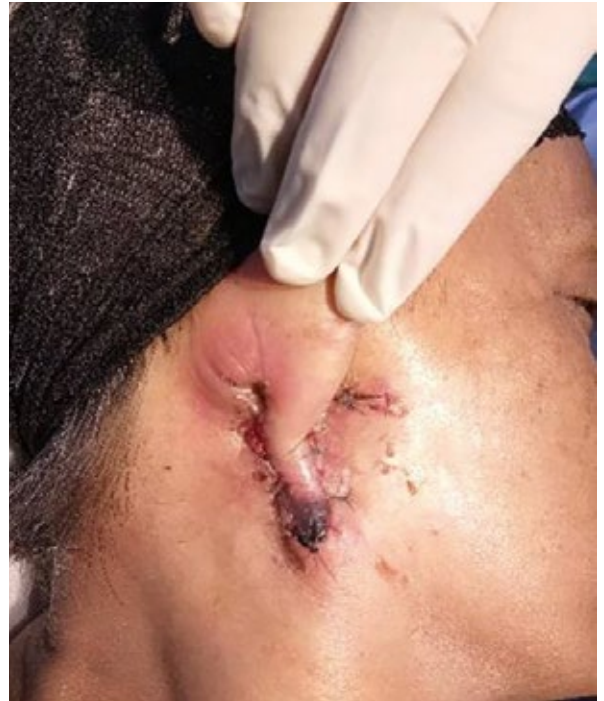
Fig. 3. Postoperative follow-up

6% of all cutaneous malignancies, in which 50–60% are SCC, 30–40% are basal cell carcinomas (BCC), and 2–6% are malignant melanomas (5) . Carcinoma of the pinna and the external canal usually presents as a slow growing painless mass. However, itchiness, pain and minor bleeding may occur as the lesion enlarges if it is left untreated (6) . Our case did not follow the classical presentation such as a slow growing painless mass, but the patient presented with a non-healing wound despite conservative treatment.