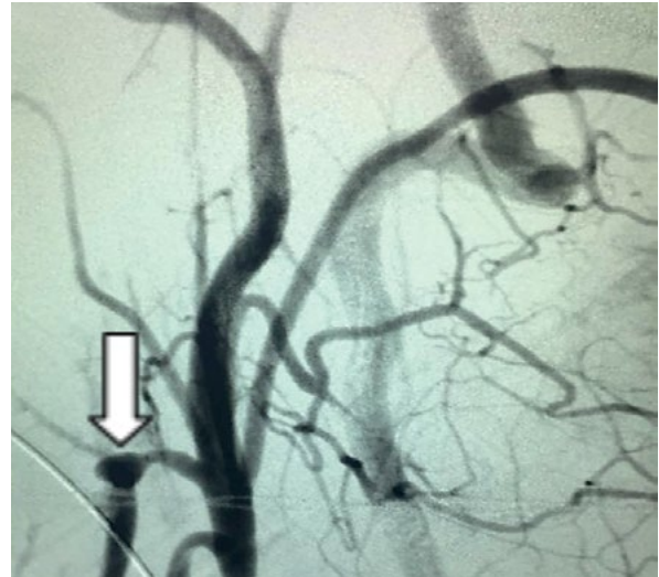
Fig. 1. Computed tomography angiogram of carotid arteries demonstrating a small pseudoaneurysm arising from the left facial artery

Once the patient's vital signs stabilised, an examination under general anaesthesia was performed in the operating theatre. Active bleeding from the left tonsillar fossa was found. Initially, the haemorrhage was controlled for 10 minutes with electrocautery of the left tonsillar fossa, but the bleeding was still profuse in the same setting of examination under anaesthesia (EUA). Therefore, packing of the tonsillar fossa was done, but haemostasis was not achieved. Thereafter, haemostatic suture was applied, but failed. Left external carotid artery (ECA) ligation above the superior thyroid artery level was performed due to the failure of all other haemostatic methods. No more bleeding occurred at left tonsillar fossa after left ECA ligation. There was inflammation and granulation tissue in the left tonsillar fossa with no evidence of deep dissection or extensive eschar from the initial tonsillectomy. The patient was discharged in a good condition after five days post-operatively. Ten days later, he reported to the emergency department with sudden onset of haematemesis