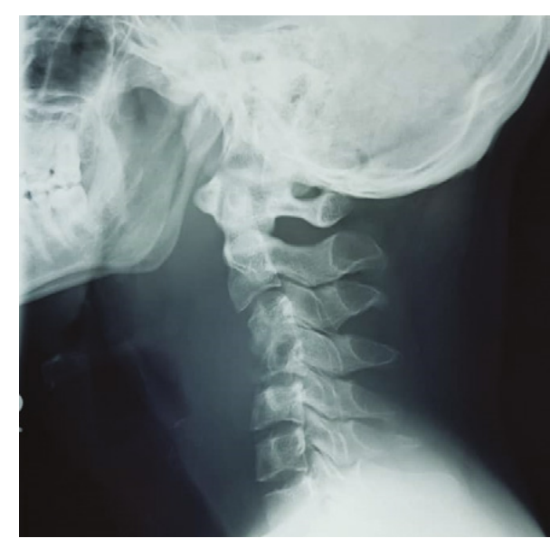
Fig. 1. Lateral soft tissue neck radiograph showed significant prevertebral soft tissue widening at level C2–C4 with anterior margin of C3 and C4 vertebral body appeared to be eroded

Flexible nasopharyngeal laryngoscopy showed a bulging mass occupying the entire left posterior pharyngeal wall with intact mucosa. The mass was not obstructing the airway and the supraglottic structures were normal with mobile vocal cords. Lateral soft tissue neck radiograph revealed significant prevertebral soft tissue widening, predominantly at C2 to C4. The anterior margin of C3 and C4 vertebral body appeared to be irregular and eroded (Fig. 1). We proceeded with contrast-enhanced computed tomography (CECT) of the neck, which showed a large left parapharyngeal abscess with retropharyngeal, intraspinal and upper mediastinal extension, which led to C4 destruction, highly suggestive of tuberculosis (Fig. 2). Laboratory investigations showed normal blood counts with raised erythrocyte sedimentation rate (ESR) of 66 mm/hour and raised