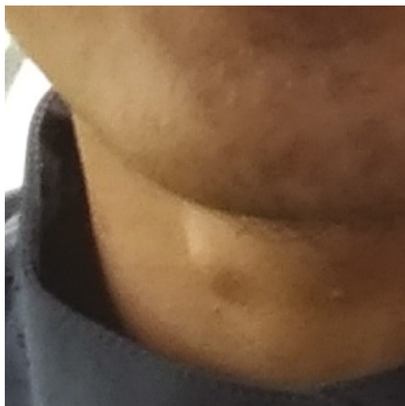
Fig. 1. Superficial, right lateral neck mass measuring 1 × 1 cm

Upon examination, the patient appeared comfortable, febrile and not in respiratory distress. A neck examination revealed a painless, superficial, right lateral neck mass measuring 1 × 1 cm (Fig. 1), cystic, non-pulsatile and mobile in all directions. An intraoral examination along with flexible nasopharyngolaryngoscopy were unremarkable. All cranial nerves were intact. Otoscopy and nasoendoscopy examinations were also normal. A provisional diagnosis of right