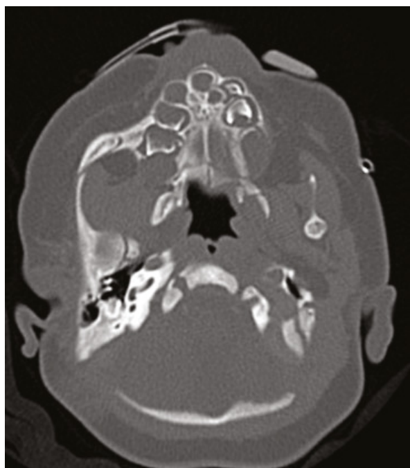
Fig. 5. Triangular shaped palate with a midline ridge