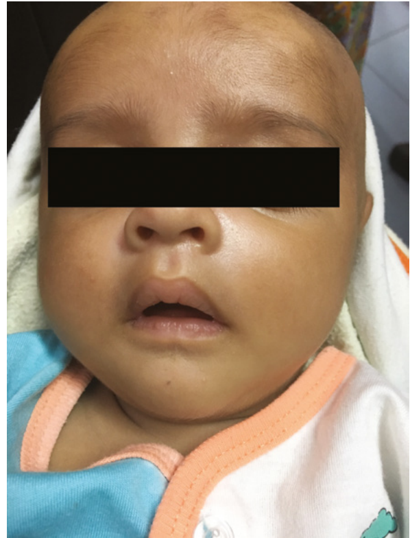
Fig. 4. Patient seen in clinic keeping well at 1 month of life