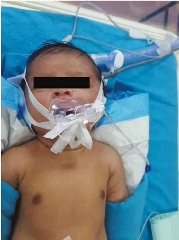
Fig. 3. Patient with McGovern nipple in place