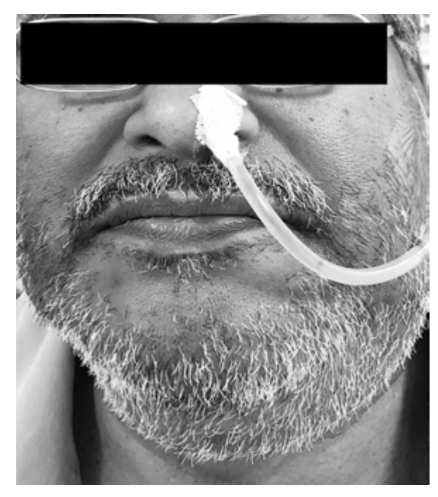
Fig. 2. Submental collection post drainage

The following day, the ribbon gauze was removed, and the patient was successfully extubated. Flushing with diluted povidone was done daily. However, 3 days post incision and drainage, the patient developed worsening submental